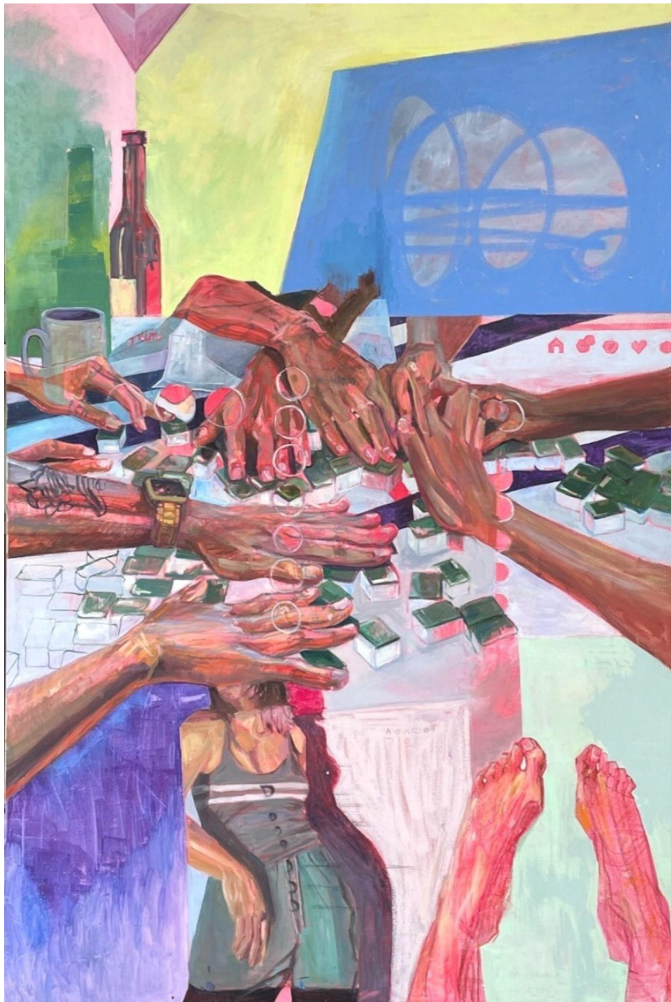
Interconnected Acrylic and oil on canvas 72 x 48 inches June 2022