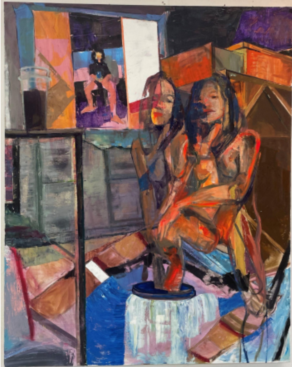
Present (v) Oil on Canvas 60 x 48 inches May 2022